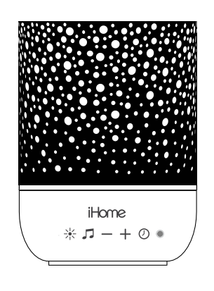
1. iZM100 speaker