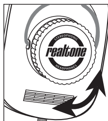
On-Ear Volume Control

Connect the headphone plug to the headphone jack of your music player. Be sure that the plug is fully inserted into the jack. If the plug is not fully inserted you may only hear sound from one side of the headphones.